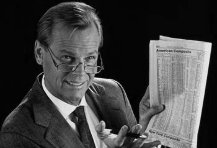
Block Grant Program

Low or no-interest loans are available to income eligible households for various improvements to their homes.